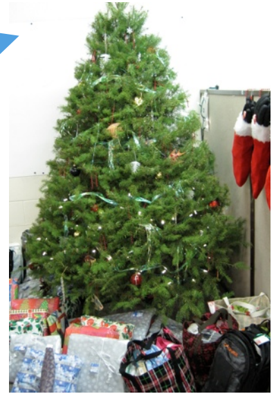
Tree and Gifts

ILP had a great Holiday Party with homecooked food, presents, a tree, and friends!